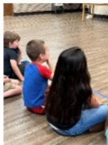
Bonzo Crunch came to visit the children and they LOVE Bonzo.