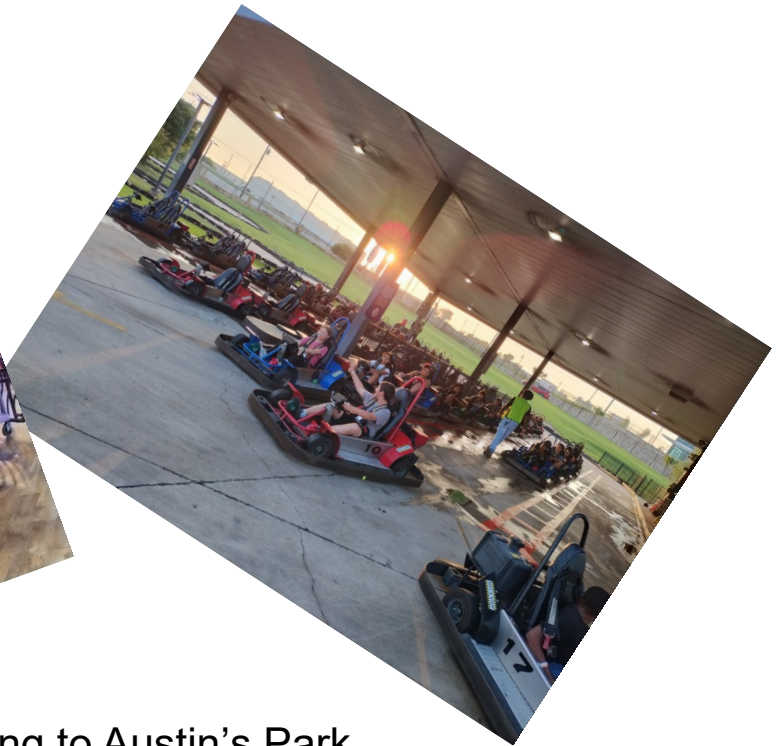
April Youth Outing to Austin's Park.